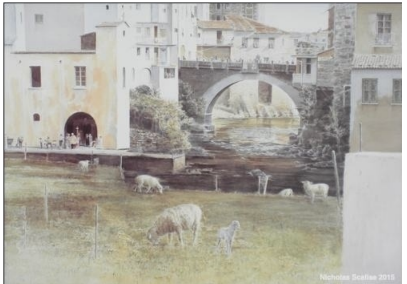
“A Peaceful Village” - Nicholas Scales

[Acknowledgements : Labyrinth Reflections by Cathy Rigali & Lorraine Villemaire ; Images accessed from Google Images of Peace 26.4.19 ; St Francis statue @ St Francis College Milton used with permission ]